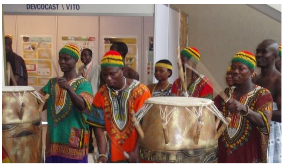
A performance at the African Association of Remote Sensing for the Environment