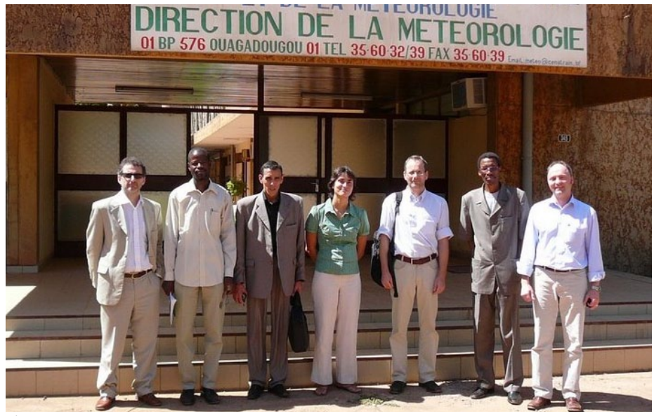
The Mission Team at the Burkina Faso Department of Meteorology

The mission team identified a number of activities which could lead to improved use of space-based information for disaster management in the country. Included in their list of recommendations were: to integrate space-based information elements into the National Multi-risk Contingency Plan currently under development; customized training sessions for remote sensing, GPS and geographic information systems; compilation of existing paper-based disaster information documents and integration of currently delinked information sources; and identification of a national focal point to request imagery from international satellite data mechanisms and to distribute it to the relevant end-users. UN-SPIDER will continue to work with Burkina Faso and the Mission Team in order to move forward with the insights gained. For the biennium 2008-2009, fifteen such UN-SPIDER Technical Advisory Missions are planned. Member States of the United Nations which are interested in receiving such advisory support should contact UN-SPIDER.