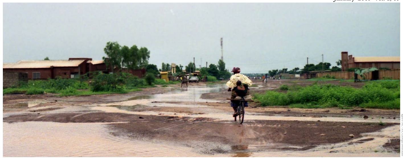
Burkina Faso experiences the hydrometeorological extremes of flood and drought